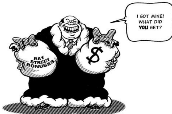
THE BOAST OF CHRISTMAS PRESENTS